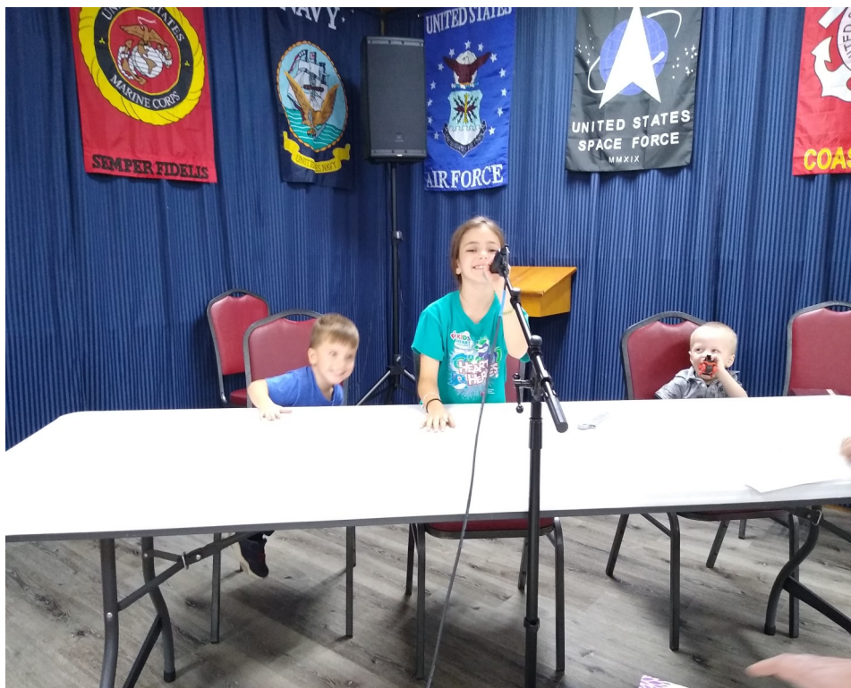
The future leadership of New Beginnings Church.