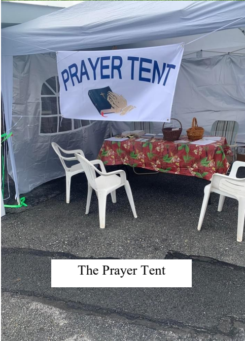
The Prayer Tent

Lots of good food was provided by the fellowship team for all to enjoy on a donation basis. (Soup, sandwiches, chips, cookies, etc). Thank You.