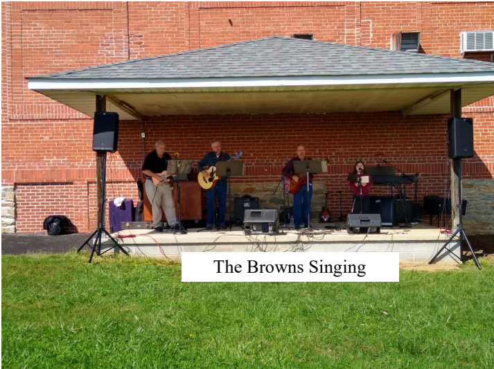
The Browns Singing