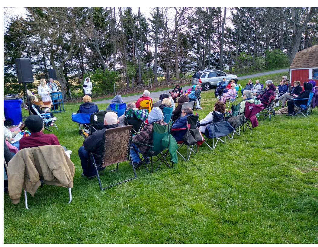
Easter Sunday service outside on Dale Haines hillside!! Brrrr!! God's frozen chosen!

On April 17, Easter Sunday, New Beginnings Church went outside on Dale Haines hillside to worship. It was very cool but with coffee, hot chocolate and pastries to enjoy by the fireside after church service all in attendance had a great worship experience. Praise God for His provision of not only a space to worship but sustenance as well. What a mighty God we serve!!